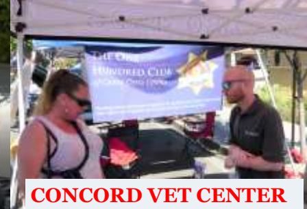
CONCORD VET CENTER

VETERANS MEMORIAL BUILDING, DANVILLE COFFEE EVERY SATURDAY 9-12. DROP IN AND VISIT WITH FELLOW VETERANS.