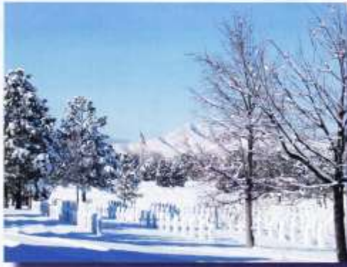
Fort Logan National Cemetery, Colorado

In 1973, Congress transferred 82 national cemeteries from the Department of the Army to the Veterans Administration, now the Department of Veterans Affairs (VA). These were added to the 21 VA cemeteries at hospitals and nursing homes to comprise 103 cemeteries in what was then the National Cemetery System.