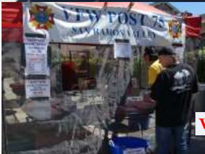
VFW HOTDOG STAND