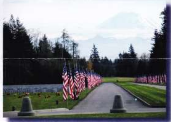
Tahoma National Cemetery, Washington

On November 11, 1998, the Veterans Programs Enhancement Act was signed, changing the name of the National Cemetery System to the National Cemetery Administration.