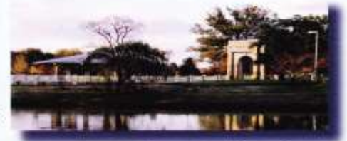
Chattanooga National Cemetery, Tennessee

More than 3 million Americans, including Veterans of every war and conflict - from the Revolutionary War to the conflicts in Iraq and Afghanistan - are buried in VA's national cemeteries.