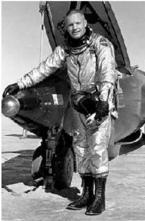
Navy Pilot, Neil Armstrong

Program Presented by the Veteran Service Organizations of the Veterans Memorial Building of San Ramon Valley Friday November 11, 2022 at 11:00 am Main Hall on Prospect