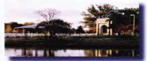
Chattanooga National Cemetery, Tennessee

More than 3 million Americans, including Veterans of every war and conflict - from the Revolutionary War to the conflicts in Iraq and Afghanistan - are buried in VA's national cemeteries.