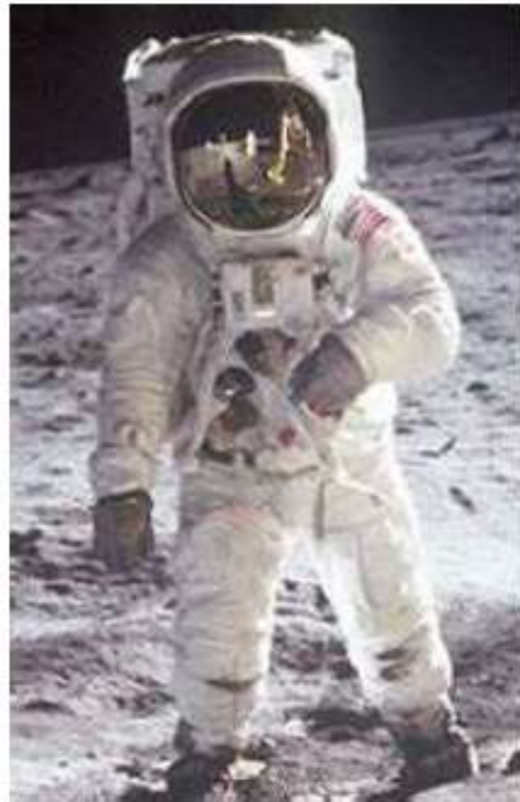
Astronaut, Neil Armstrong