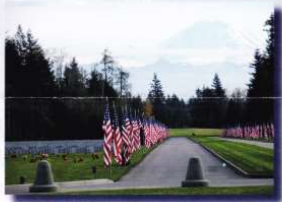
Tahoma National Cemetery, Washington

On November 11, 1998, the Veterans Programs Enhancement Act was signed, changing the name of the National Cemetery System to the National Cemetery Administration.