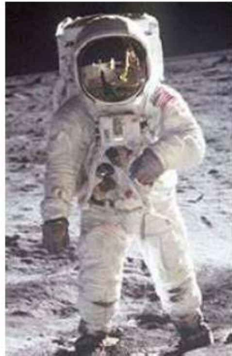
Astronaut, Neil Armstrong