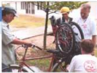
THIS PAGE: (L) COURTESY FROM TOP LEFT: (R) VIETNAM VETERANS OF DIABLO VALLEY, CALIFORNIA HELP A WHEELCHAIR RECIPIENT WITH HIS NEW WHEELCHAIR. (C) VIETNAM VETERANS OF DIABLO VALLEY RECEIVE THANKS FROM THE DIRECTOR OF THE VIETNAM FRIENDSHIP VILLAGE. (R) WHEELCHAIR RECIPIENT HEADS HOME WITH HOPE FOR THE FUTURE.

Vietnam Veterans of Diablo Valley, California