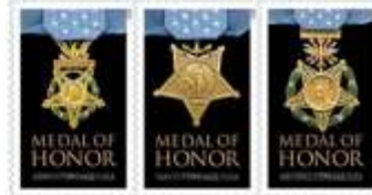
Use the new Medal of Honor Forever Postage Stamps