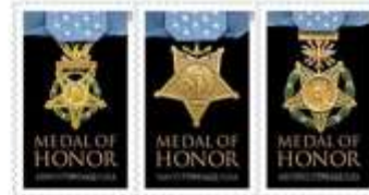
Use the new Medal of Honor Forever Postage Stamps