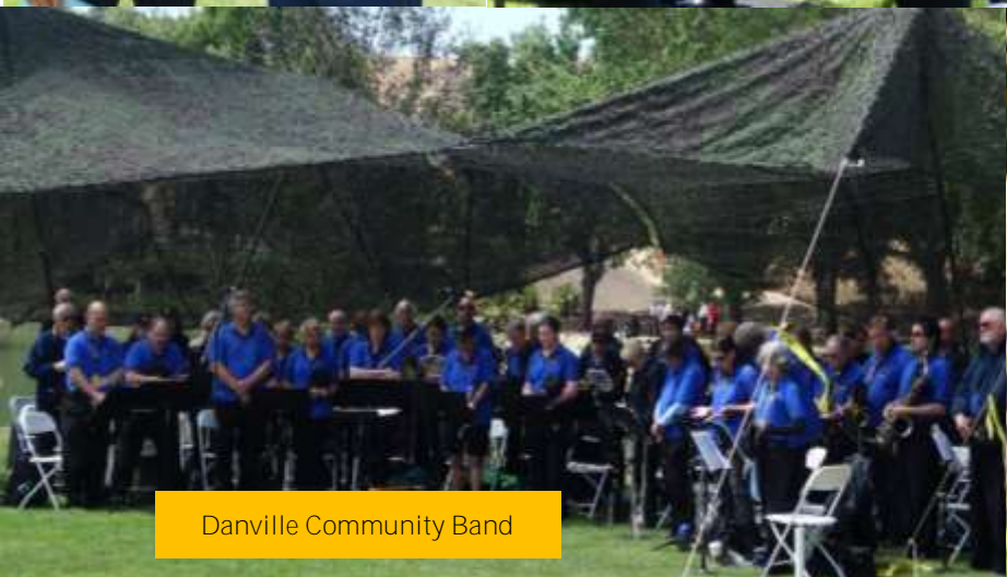
Danville Community Band