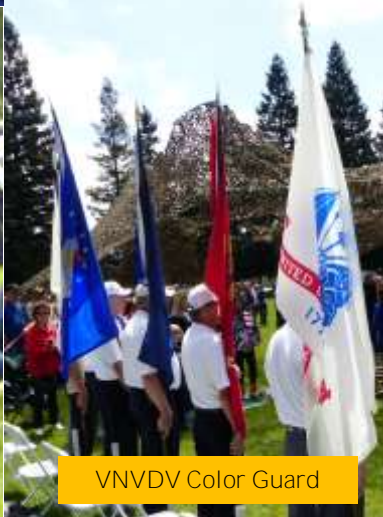
VNVDV Color Guard