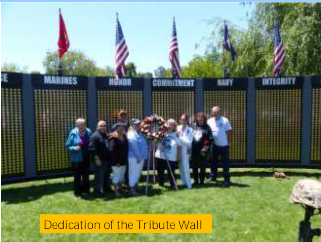
Dedication of the Tribute Wall