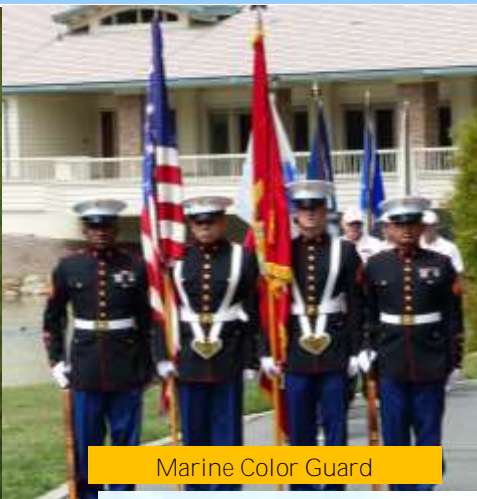
Marine Color Guard