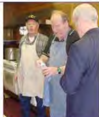
Yes - it's true... Pete's kitchen was a popular place to be and to be seen... Congressmen and even an occasional President hung out in Crab Feed kitchen