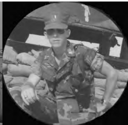
Who better to tell the story of the Vietnam War, than the Vietnam Veterans themselves. The Vietnam Veteran's personal experiences are the stories that truly capture the legacy of the Vietnam Veteran.

and those still listed as unaccounted for. The mission of the H&E Branch is to provide the American public and school grades six through 12, with a clearer understanding and appreciation of the service, valor and sacrifice of our Vietnam War veterans and to