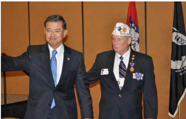
Secretary of Veterans Affairs Eric K. Shinseki spoke during the opening reception and meeting at this year's Military Order of the Purple Heart 81st Annual National Convention in Rogers, Ark.